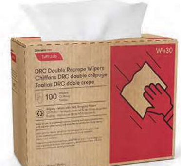
Lint-Free Paper Towels