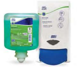
Hair & Body Shower Gel