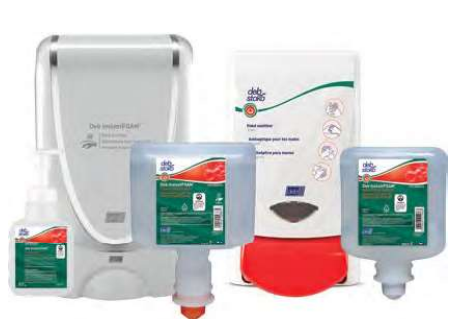
Foaming Hand Sanitizer