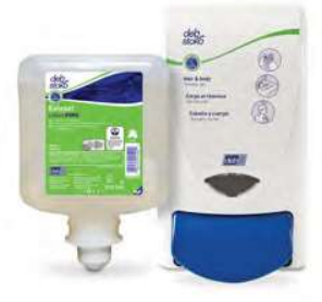
Light Duty Cleanser